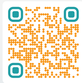
SCAN FOR PREMIUM ALL INCLUSIVE BEVERAGE MENU